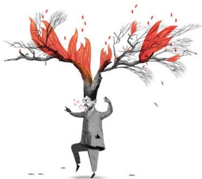
Illustration by Brett Ryder

America's coastal universities housed most of the other lot, "saltwater" pragmatists. To them, the double-digit unemployment that accompanied Mr Volcker's assault on inflation was proof enough that markets could malfunction. Wages might fail to adjust, and prices might stick. This grit in the economic machine justified some meddling by policymakers.